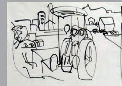
Hans Hofmann Untitled (Tractor) , ca. 1935, India ink on paper, 8 1/2 x 11" (paper size), 13 5/8" x 16 1/8" (framed size). Estate stamps on reverse: HH Estate #M- 0933/261. Donated by Sigrid Freundorfer Fine Art, LLC