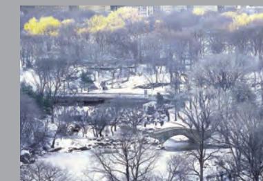
Betsy Pinover Schiff Bow Bridge, Central Park, Winter , Photograph 22" x 30", one of an edition of 15, matted. Printed on archival fine art paper. Together with a signed copy of her book Windows on Central Park Donated by the photographer.